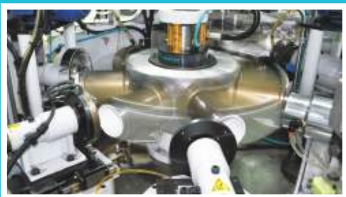
Paper Cup Forming Machine 紙杯成型機