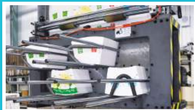
Die Cutting 模切機