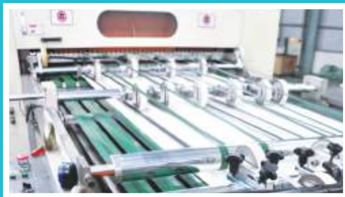
Paper Cutter 裁切機