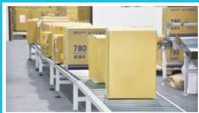
End Product 成品輸送入倉