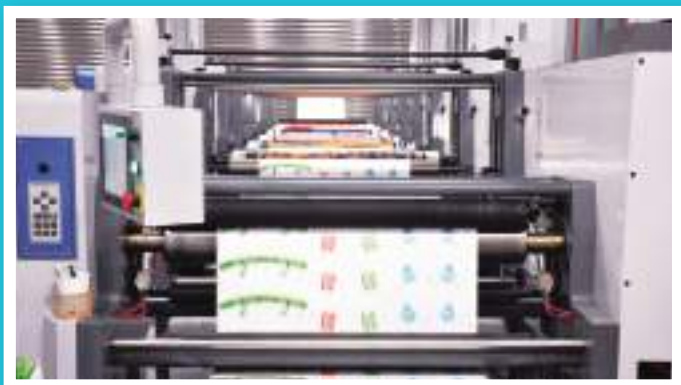
Flexographic Printing 環保水墨凸版印刷機