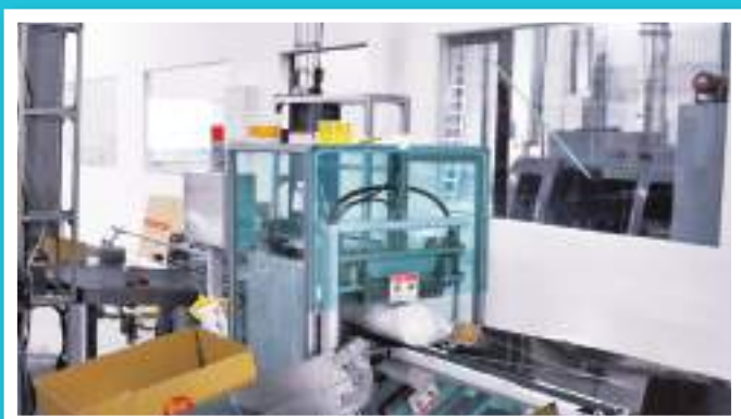
Automatic Packing Machine 自動包裝機