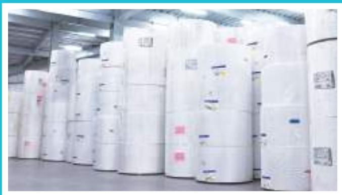
Paper Rolls Warehouse 原紙倉庫

To ensure all products have stable quality, HG adopts high-quality production equipment. 採用高品質的生產設備，確保所有產品的品質有一致的表現