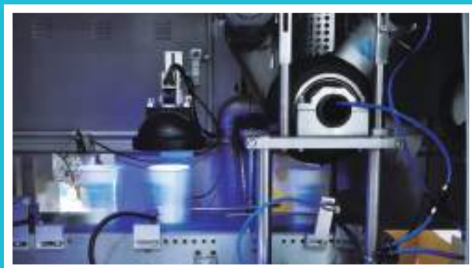
Inspection Machine 紙杯檢測機